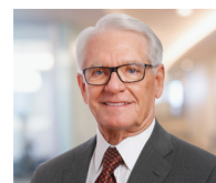
Charles R. Schwab Co-Chairman