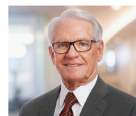
Charles R. Schwab Co-Chairman