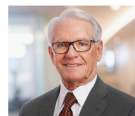
Charles R. Schwab Chairman