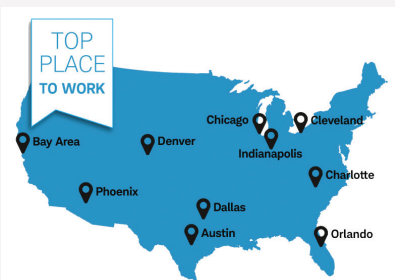
Top Workplace in our major markets

Learn more at www.aboutschwab.com/citizenship