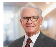
Charles R. Schwab Chairman