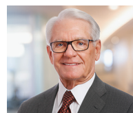
Charles R. Schwab Co-Chairman