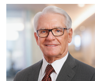
Charles R. Schwab Chairman