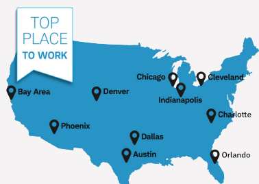
Top Workplace in our major markets

Learn more at www.aboutschwab.com/citizenship