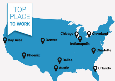
Top Workplace in our major markets

Learn more at www.aboutschwab.com/citizenship